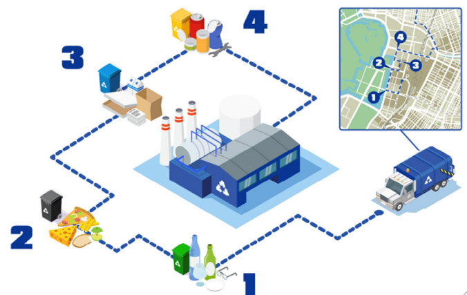
Image: collection route optimization